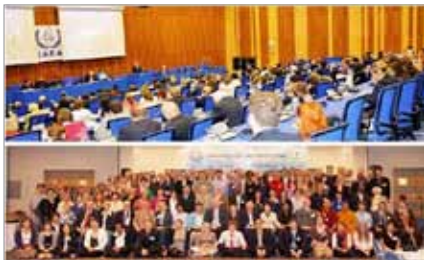
WFP Europe At the UN in Vienna: Youth Perspectives on Peace 250 Participants - June 2011