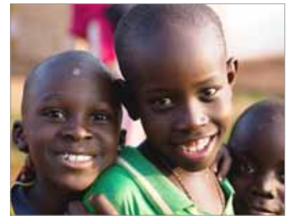
WFWPI is a 501(c)3 Non-Profit Organization

● Schools, ● Scholarships, ● Nutrition, ● Sanitation, ● AIDS Prevention, ● Medical Aid, ● Vocational Training, ● Micro Credit