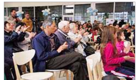
WFP Switzerland International Day of Peace Celebration in Zurich 160 Participants - September 17, 2011