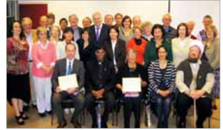
WFP Netherlands International Day of Peace Seminar 35 Participants September 21, 2011