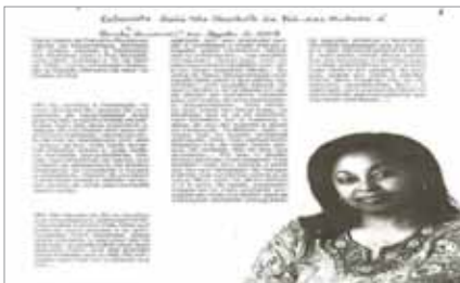
WFP Portugal Publication of an article about the current WFP President August 2010