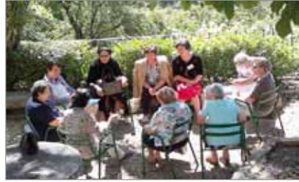
WFP Europe Seminar in Madrid, Spain: "Educations for a Culture of Peace" 90 Participants May 26, 2011