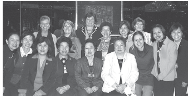
Women's Federation for World Peace Int'l Delegation to 50th CSW