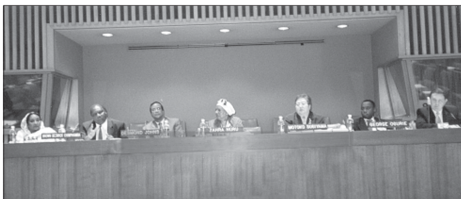
The Forum: Intensifying HIV Prevention