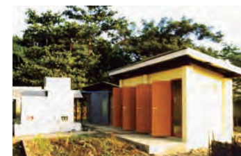
Toilet constructed in Thingun kyun

In 2008, 50 toothbrushes were donated to children of an orphanage in North Da Gon.