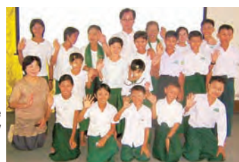
Foster children who were confirmed safety

The children will be able to restart a wonderful school life in the new school building.