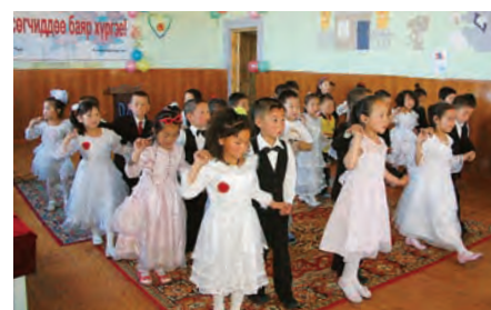
A folk dance was performed at the graduation ceremony