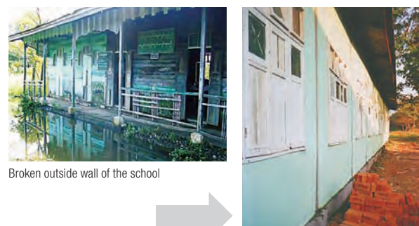
Broken outside wall of the school