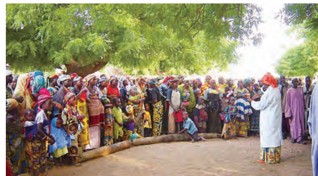
Hygienic instruction by a public health nurse at Kaba Dakuna Village

Medical assistance in the regions with the highest morbidity from malaria has been continuous since 2004, in attempt to exterminate malaria. Creation of sanitary conditions to prevent mosquito breeding is the highest priority for prevention of malaria. So selling mosquito nets with medicine has started in 2006, giving priority and a discounted price to pregnant women.