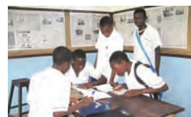
Junior high students meeting in front of the newspaper board

Since the 2004 implementation of University Scholarships for graduates, the number of students who apply to attend university has increased.