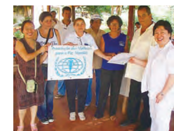
Donation of free tickets for medical examinations to an indigenous village

In March 2008, WFP donated 10 free tickets for breast cancer examinations to Guia Lopes City and the Women's Association for the Prevention of Cancer, in commemoration of International Women's Day. In the same month, WFP presented a course on the prevention of cancer and the importance of abstinence to 80 participants in a village of Indigenous people. On that occasion WFP donated 40 tickets to the villagers for free examinations.