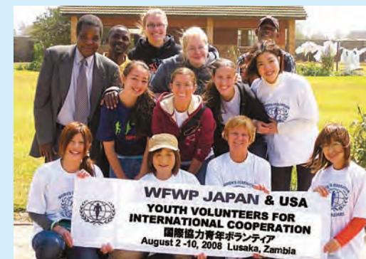
Youth volunteers from Japan and USA