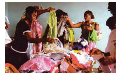
Goods from Japan are sold at the bazaars

The foster parents program supports children from poverty-stricken families.