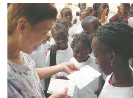
Translating a letter from a Japanese foster parent for a foster child

The Foster Parents Program which began in 2008 is supporting children from low-income families.