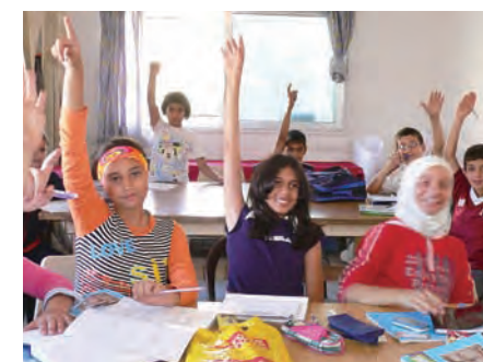
English language class for children