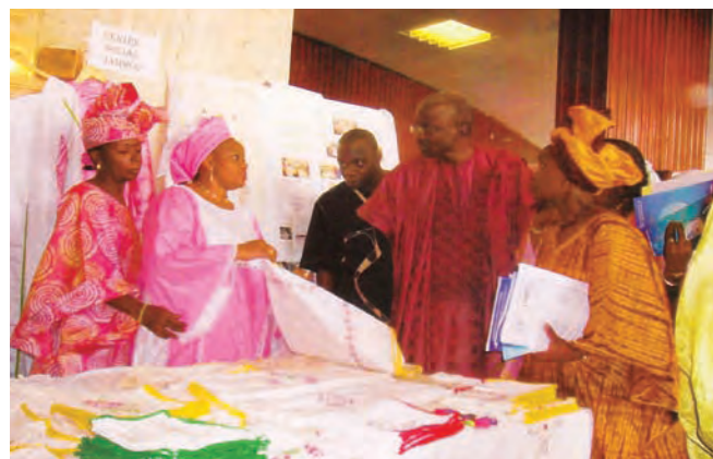
Minister of Education encouraged at Jamoo's booth of the exhibition