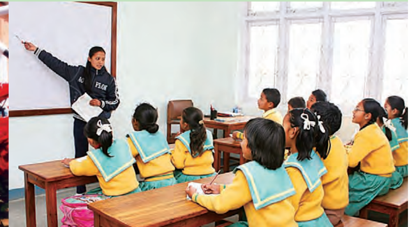
A class of the elementary school