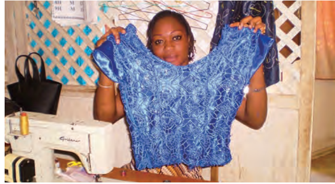
A trainee studying at a training shop