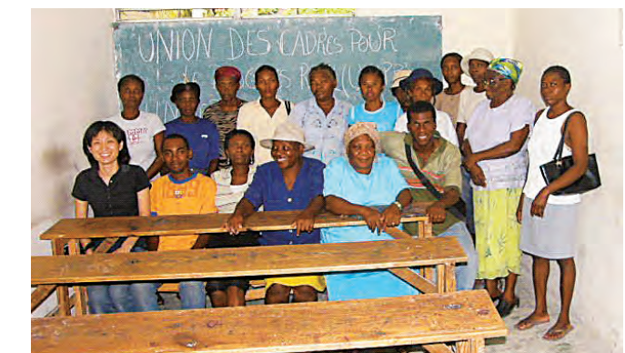
Students of Literacy Class

New Developments: In the Haitian capital city of Port au Prince, a nighttime six-month literacy course for adults was begun in May 2008. This literacy class provides a one-hour lesson every weekday evening at a classroom borrowed from a local college. Tuition is free. This class enrolled 75 students with an average age of 50 years old.