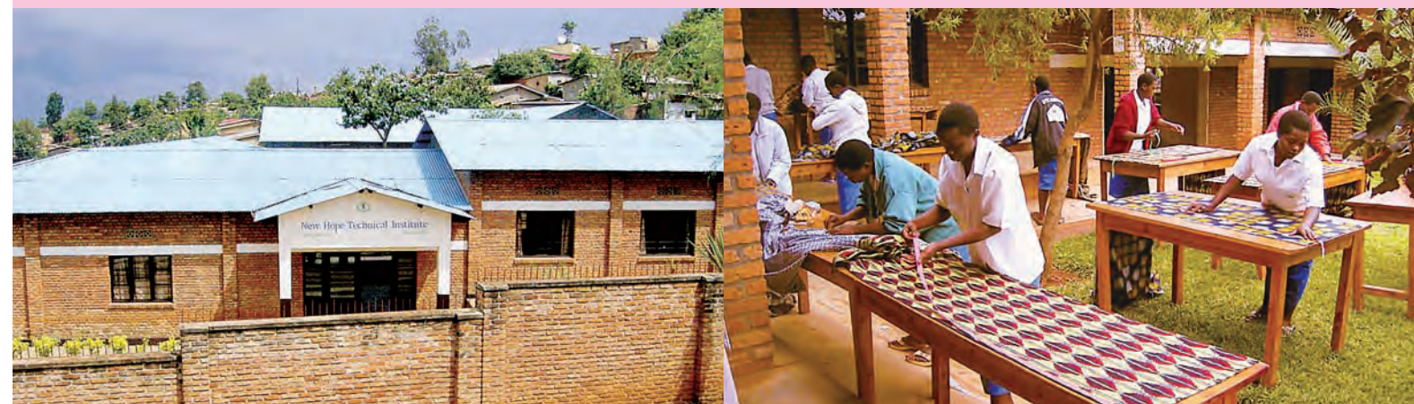
Cutting cloth at Dressmaking course