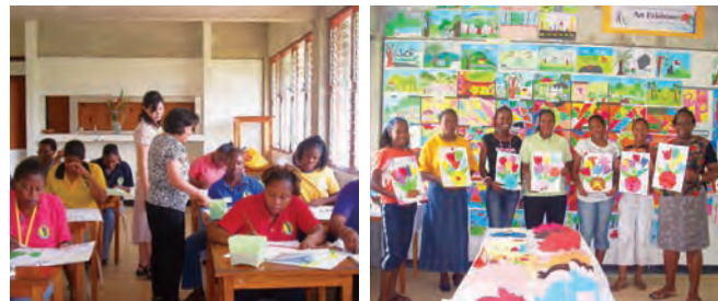
A class of art education