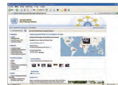
Website of UN-NGO-IRENE

In 2007, the Innovation Fair was initiated as a parallel event to the Annual Ministerial Review (AMR) during the first week of the Substantive Session of the Economic and Social Council (ECOSOC). UN NGOs were given the opportunity to introduce their success stories at this event. This is one of the precious opportunities for UN NGOs to interact with ECOSOC.