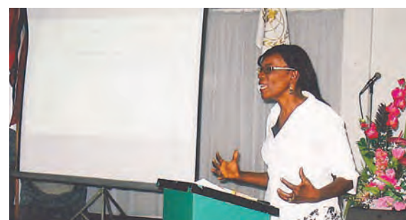
An active local lecturer

(2008) In March, a seminar, introduced by the Secretary of UNDP, was given to 48 of St. Joseph public school teachers and students ages 11 and 12. In Diego Martin, a seminar was given to eighteen adults and young people interested in AIDS prevention. Among the participants, there was a girl who belonged to an Abstinence Club and maintained her conviction and purity. She was impressed