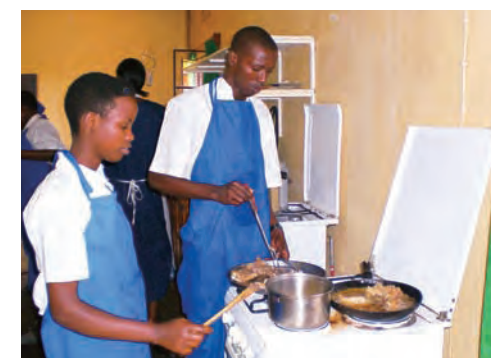
Ex-combatant training at Cooking course

The government of Rwanda is presently focusing on the fields of technical education and vocational training and in the middle of systematizing their education systems. Therefore, the government hopes maintaining management of the vocational training schools and support for the their students.