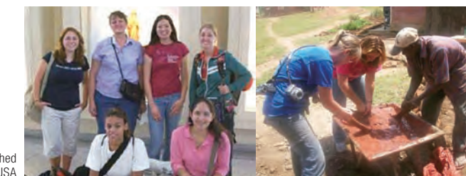
Youth Volunteers dispatched from WFP, USA