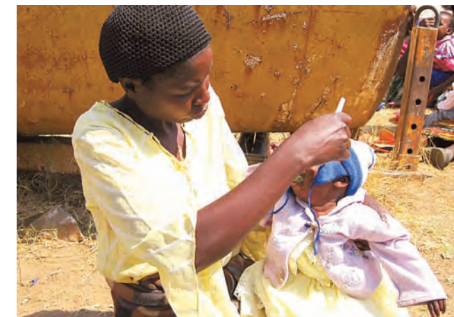
Mother is feeding porridge at a nutrition class

The number of graduates has rapidly decreased since 2007. This is because two of the clinics have neither roof nor enough space for the class so we are forced to conduct the class in the open air, risking exposure to bad weather. Rainy weather causes a decrease in the number of participants and hinders giving nutrition guidance with composure and prevents effective practice in making and feeding the porridge. As a result participants have a harder time understanding the instructions. Another reason for the decrease in participants; the local staff are so sympathetic toward the participants that they allowed many participants remain enrolled in the class so that they could keep getting a supply of soy flour, even though they could and