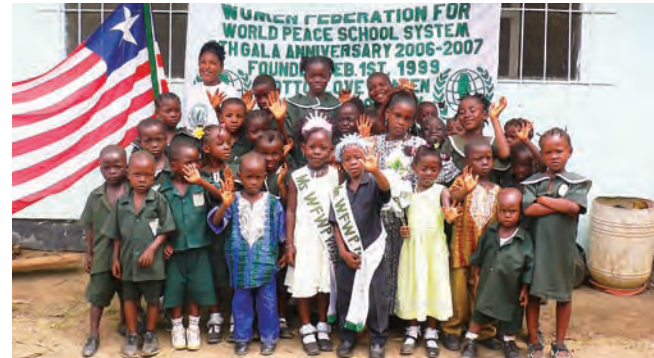
A contest of Mr. and Miss WFWP as a PR event of the school