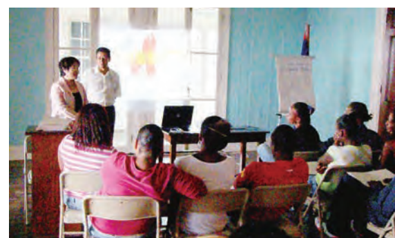
Seminar at a culture center

(2008) Seminars were given 4 times to about one hundred people at a school, a church, a library and a culture center.