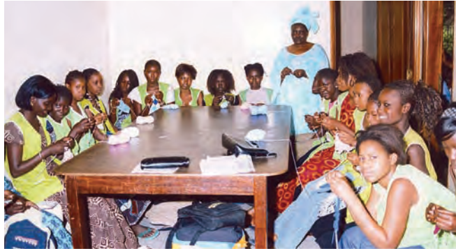
A class of knitting