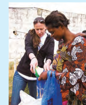
Delivering soy flour