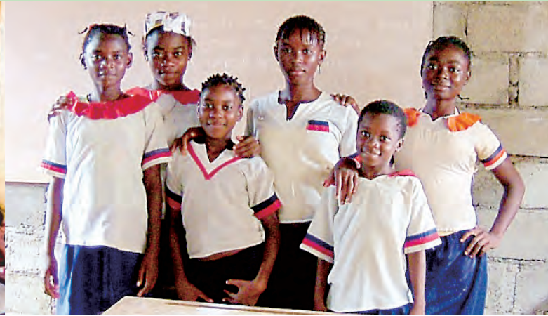
Children of Elementary school