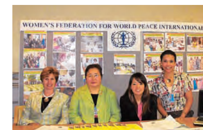
An exhibition booth of WFP, International at UN Headquarters