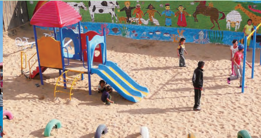
Renovated playground with play equipments