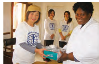
Donation of medical supplies

New Developments: In August 2008, volunteers offered financial aid covering the total registration fees for the clinic from 2009 to 2011, and donated a delivery bed, an IV stand, medicines, and medical supplies.