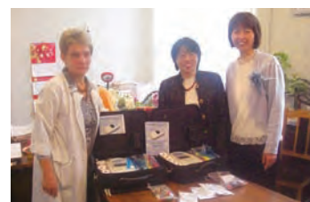
Donation of two channeled portable electrocardiographs and fixtures

Only about half of children of the region with high amounts of internal radioactive residue can receive satisfactory medical treatment. When volunteers discovered that the dosage of VITAPECT-2 (a health food made from apple pectin as its main material) developed by the Institution of Radiation Safety "BELRAD" is effective for the recovery of the children's health, WFP volunteers initiated support for distribution of VITAPECT-2 to children in 2008. In October 2008, WFP volunteers visited the "BELRAD" and provided financial aid to the institute to provide twelve patients with the dosage of VITAPECT-2 for one year.