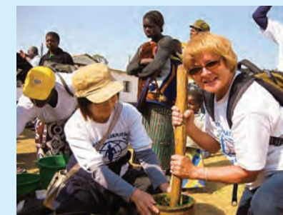
Mashing vegetables for cooking instruction of porridge