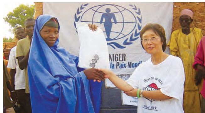
Donation of mosquito nets