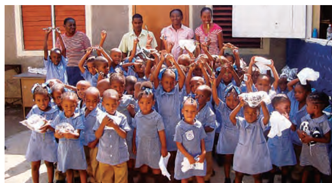
Children are pleased with the gifts from Japanese supporters