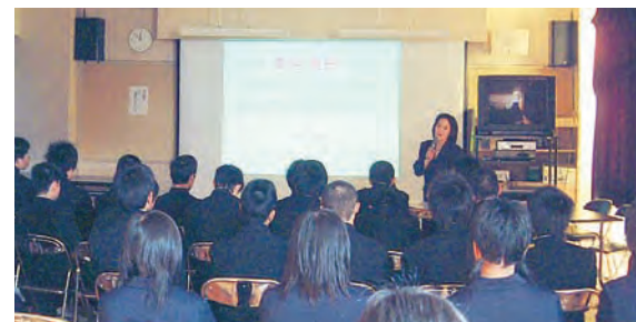
Seminar at a Japanese school

The abstinence message contains deep concepts that resonate in the conscience of young people so the message is well received. Consequently, teachers with good common sense and parents support the program.