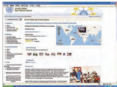
Website of UN-NGO-IRENE

URL: http://esango.un.org/irene/Index?page=viewPractice&nr=130