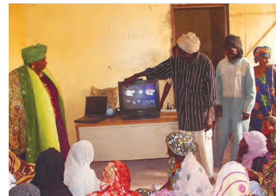
Seminar for mothers who have infants and young children