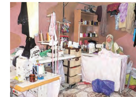
A woman who succeeded in financial independence by microcredit project

A woman with nine children received a loan in 2002. In the beginning she was operating a tailoring business all alone with her domestic sewing machine and not making much money. Her husband had liver disease and couldn't work. The family struggled to make ends meet. She purchased an industrial sewing machine with a loan from WFP's Microcredit project. Suddenly she began receiving orders from large wholesalers and her workload increased dramatically. She purchased more industrial sewing machines with an additional loan and could have three employees. Her husband passed away, but she is able to raise her 9 children on her own.