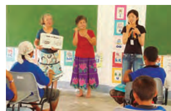
Toothbrushing Instruction by volunteers

New Developments: In 2007 WFP volunteers donated 200 toothbrushes to Nett Elementary School, and distributed 500 toothbrushes to Ohmine Elementary School and taught tooth brushing to 120 schoolchildren in the lower grades. In 2008 we distributed toothbrushes to all 950 pupils of Ohmine Elementary School, and tooth brushing instructions to 300 pupils in the middle and upper grades. We also distributed toothbrushes to all 230 pupils of Awak Elementary School and taught tooth brushing technique to 20 pupils in the upper grade and 11 in preschool class. We visited the Ministry of Education of Micronesia and donated 600 toothbrushes.