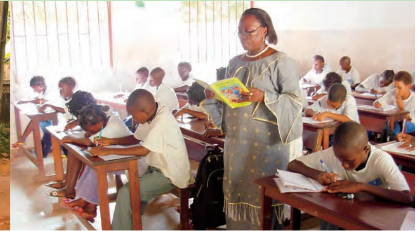
Children studying hard