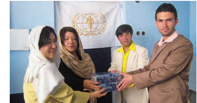
Opening ceremony of a library

New Developments: In 2008, the class had 26 students in total (18 in the novice course; 5 in beginners course I; 3 in beginners course II). 25 students completed the course. Because it is groundbreaking in the region for uneducated women to become literate even to the level of first grade in elementary school, many participants expressed their delight in reading independently. Senior students sometimes mentor junior students, helping those who cannot come to the regular gatherings.