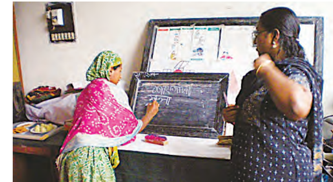
Mothers studying hard

New Developments: Fifty seven children were taught in 2007 and 65 children in 2008. In 2008, Japanese supporters donated stationery, shoes and towels for the pupils.