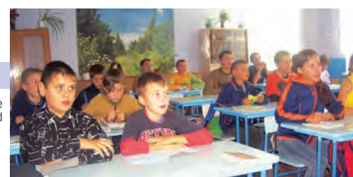
Children of the center are studying hard

Aiming at high ideals of youth development, WFPW volunteers have been supporting the youth sports education project, "YOTIVE" since 1995. The basketball and karate teams are in training three times a week, coached by a policeman on the court of a police school. Participants are also given an education on the prevention of AIDS along with their physical training. The basketball team performs at a high level, next to that of the Ghanaian national team.