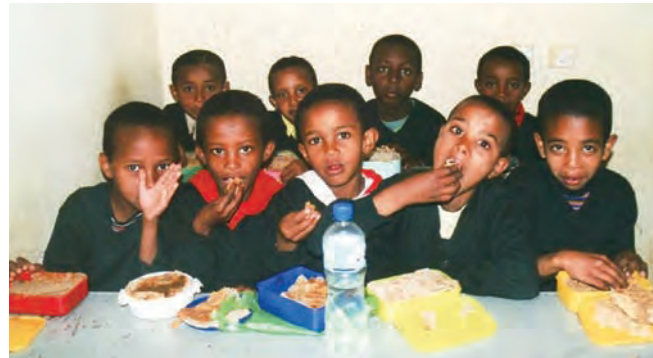
Happy lunch time