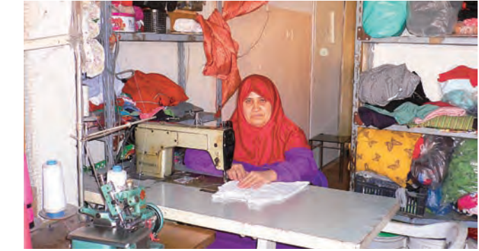
A graduate of WFP training center opened a tailoring shop by a loan