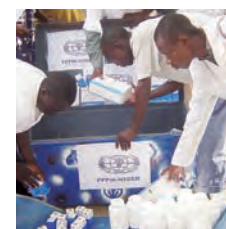
Medicine box which is managed in each village