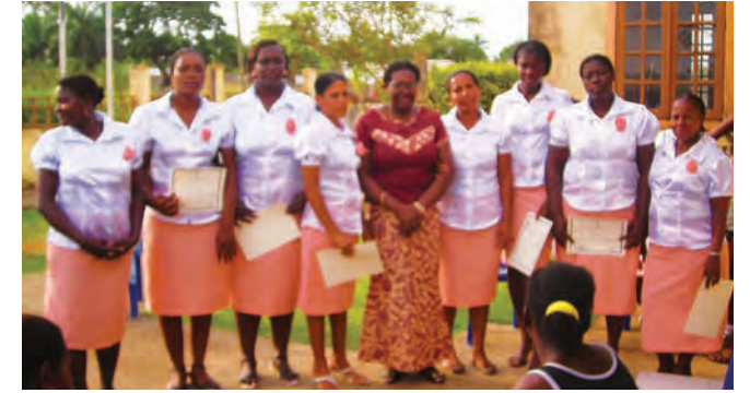
Recognized very good students at the graduation ceremony