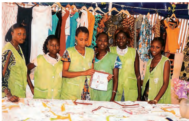
Students of Jamoo and their works displayed at the exhibition