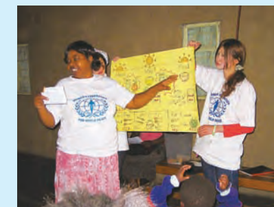
Nutrition guidance with a chart made by youth volunteers