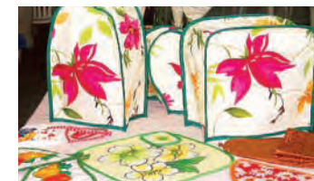
Students' works of soft furnishing class