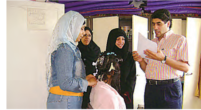
Examination of hairdressing course